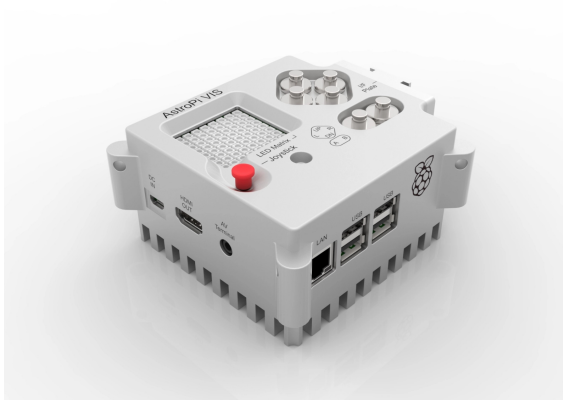
Figure 4. AstroPi case

The AstroPi case is used on the International Space Station, where there is very little airflow. It is machined out of a solid block of aluminium and acts as a very large heatsink. Getting the heat dissipation up to the required standards took quite a lot of work!