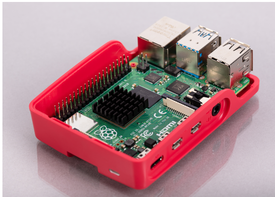
Figure 1. A Raspberry Pi in a case with a heatsink

It is important to understand that heatsinks still need to dissipate heat to their environment, which is usually air. If there is little or no airflow over the heatsink then it will have problems moving heat away, so, as for bare boards, this airflow is important.