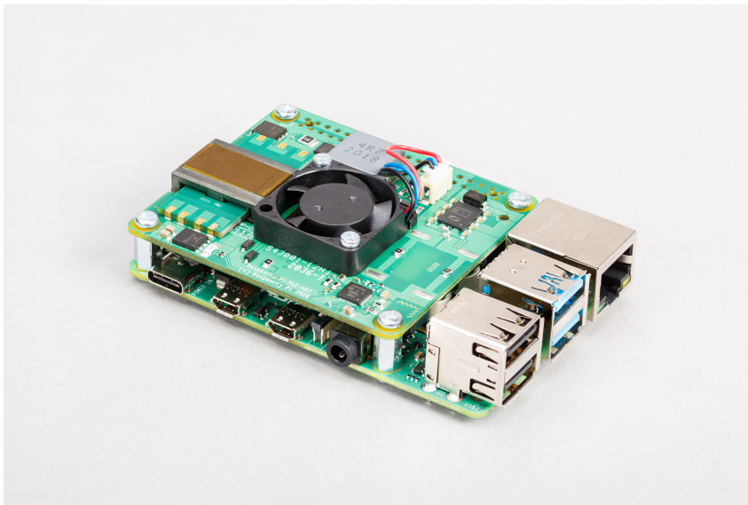
Figure 6. Raspberry Pi 4B with PoE HAT

Raspberry Pi Ltd sell a PoE HAT (hardware attached on top), a PCB that attaches to a Raspberry Pi device on the GPIO header. As well as providing the ability to power the Raspberry Pi over the Ethernet cable (with the appropriate router PoE capabilities), this accessory also incorporates a fan to cool both the Raspberry Pi and the PoE HAT itself.